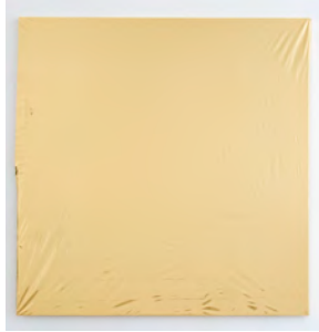
Sean Paul Golden Mirror, March 9, 1951 #10 2017 Metallized Biaxially-oriented polyethylene terephthalate (BoPET) 60 x 52 1/2 inches 152.4 x 133.4 cm SP047

Sean Paul ADVERSARIES, INC March 31 - April 30, 2017