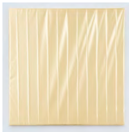
Sean Paul Golden Mirror, March 9, 1951 #8 2017 Metallized Biaxially-oriented polyethylene terephthalate (BoPET) 35 x 35 inches 88.9 x 88.9 cm SP052