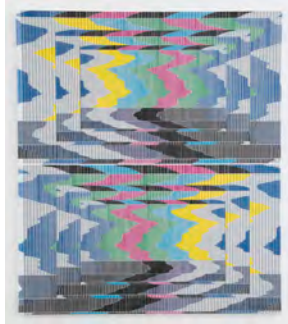
Sean Paul Improvements: Ivy Mike, Teller-Ulam – modulation left/right, receding; British Patent 9745, 1843 (SMPTE, NTSC, CMYK) 2017 Ultraviolet-curable pigmented ink and acrylic on polyester/polymide 60 x 52 1/2 inches 152.4 x 133.4 cm SP046