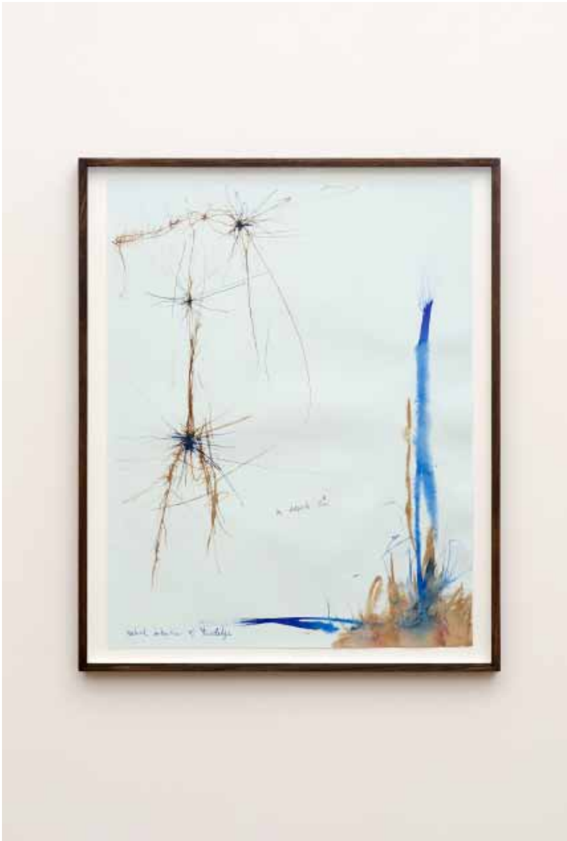
Untitled, 2014, fountain pen ink on paper, 19 1/2 x 25 1/2 inches (49,5 x 64,7 cm)