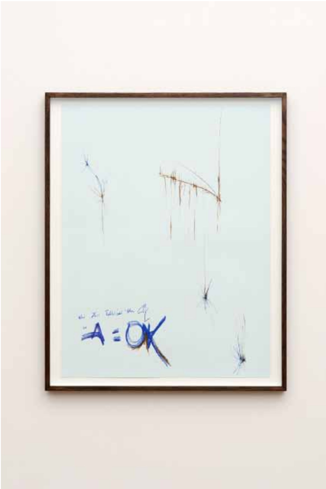
Untitled, 2014, fountain pen ink on paper, 19 1/2 x 25 1/2 inches (49,5 x 64,7 cm)