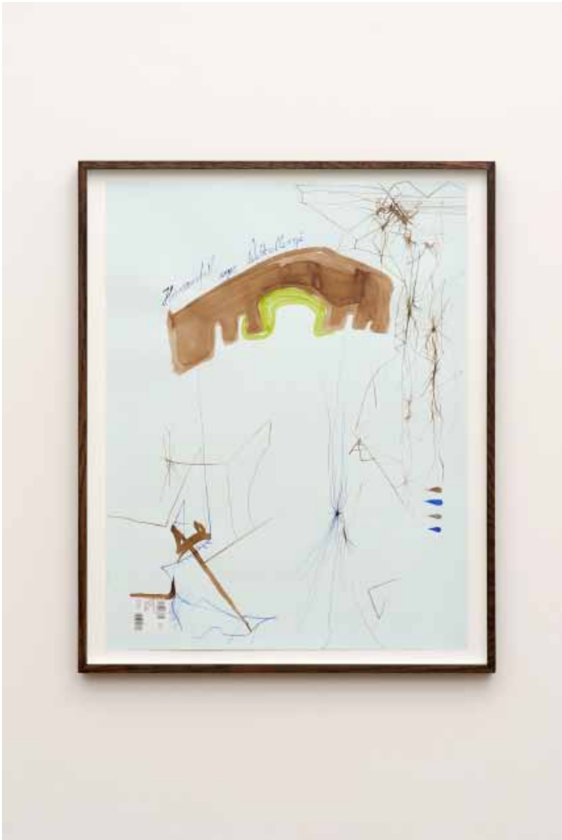
Untitled, 2014, fountain pen ink on paper, 19 1/2 x 25 1/2 inches (49,5 x 64,7 cm)