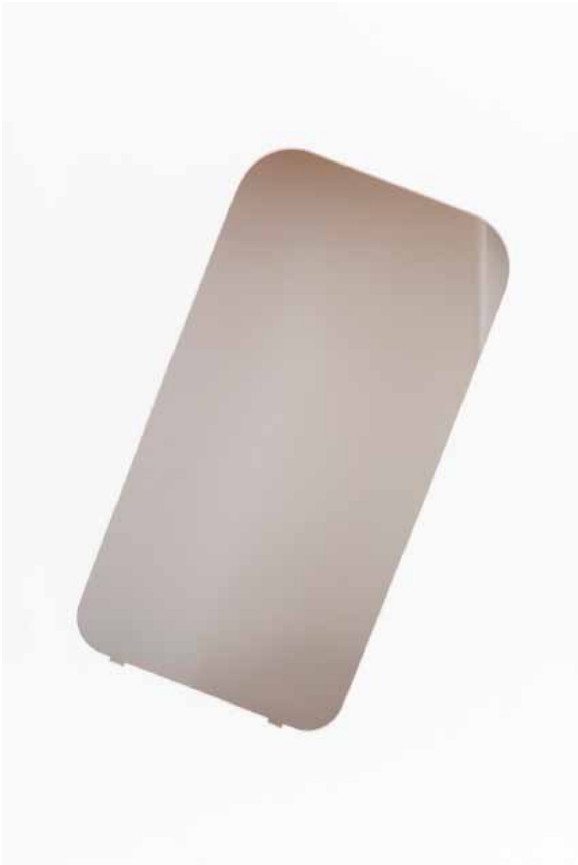
Wenn das Besondere nichts besonderes ist II, 2014, site specific installation, laser cut plywood, 18 1/4 x 38 1/8 inches (46,3 x 96,8 cm)