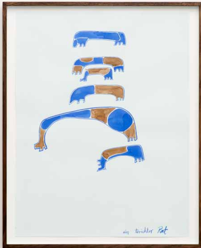
Untitled, 2014, fountain pen ink on paper, 19 1/2 x 25 1/2 inches (49,5 x 64,7 cm)