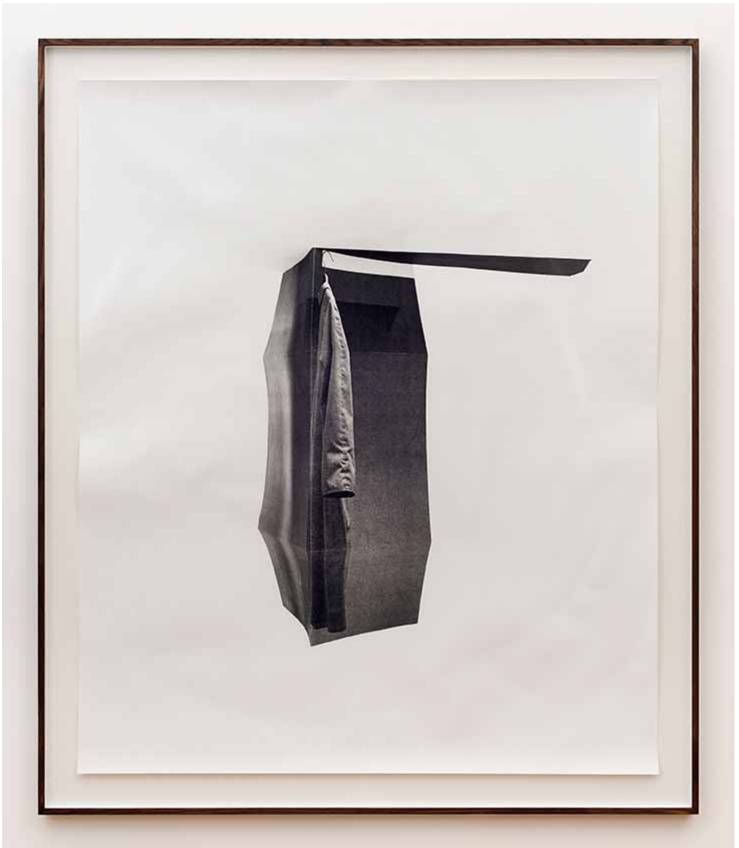
Untitled (I really must congratulate you on your attention to detail), 2012-2014, silver gelatin print (B&W), 50 x 55 inches (127 x 139,7 cm)