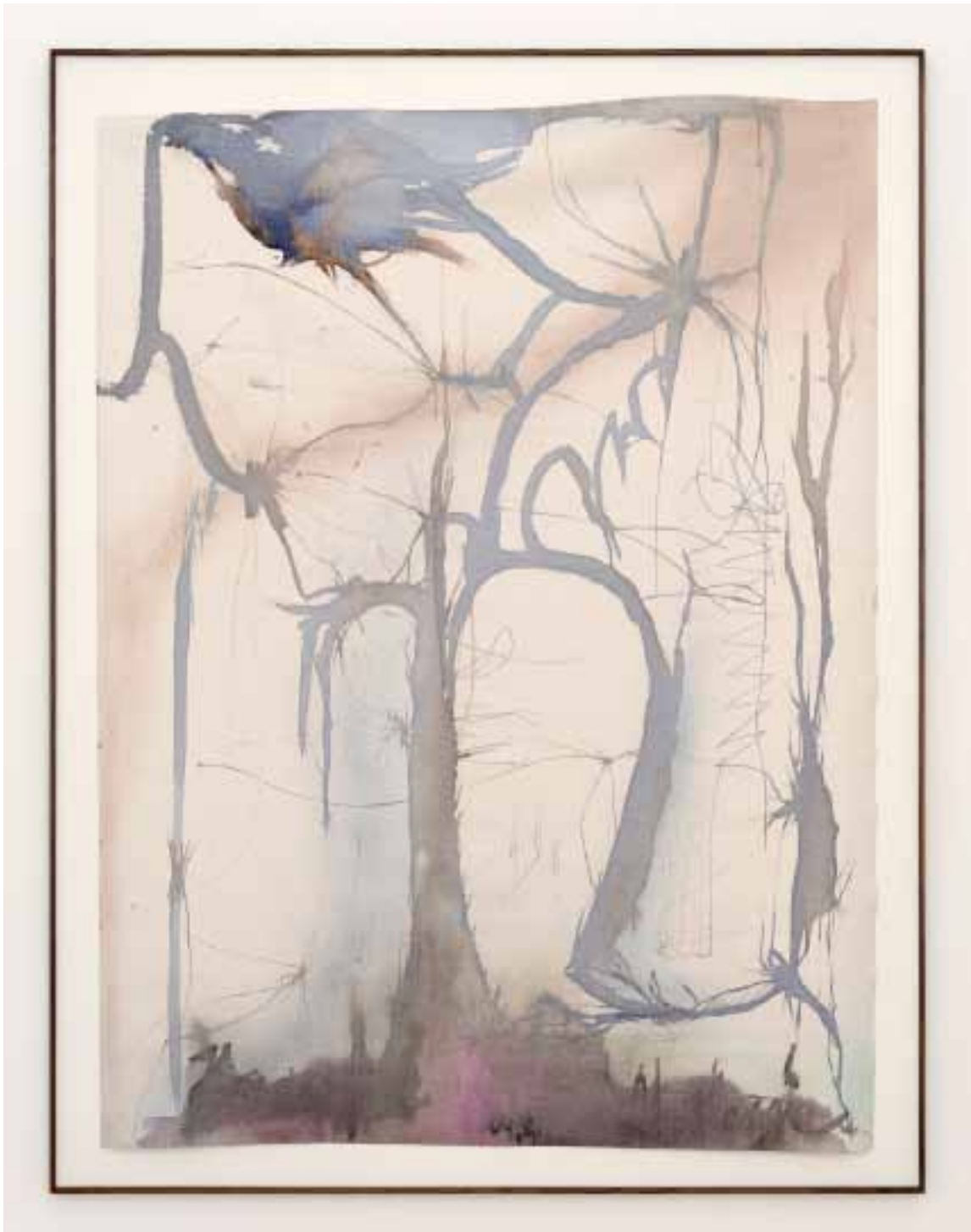
Hirnausfall wegen Weltallergie, 2014, fountain pen ink on reverse of white vinyl, 55 x 75 1/2 inches (139,7 x 191,7 cm)