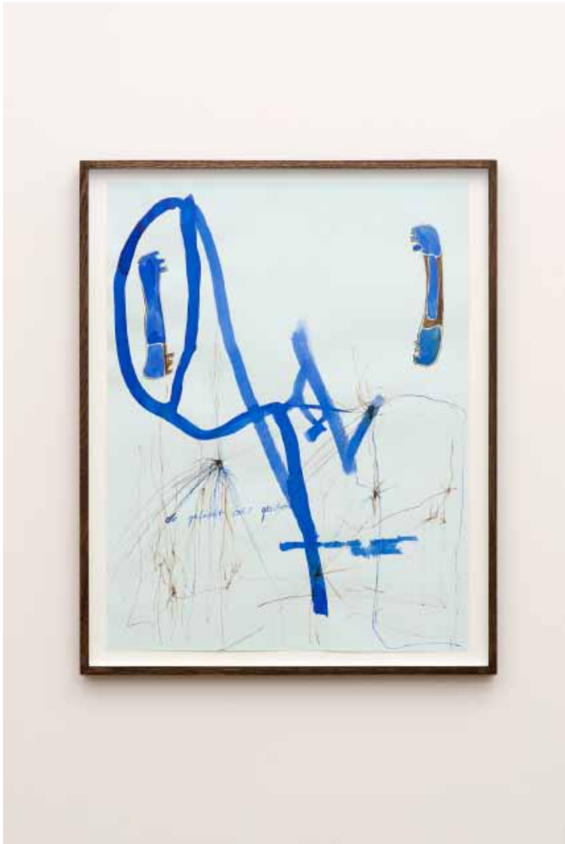
Untitled, 2014, fountain pen ink on paper, 19 1/2 x 25 1/2 inches (49,5 x 64,7 cm)