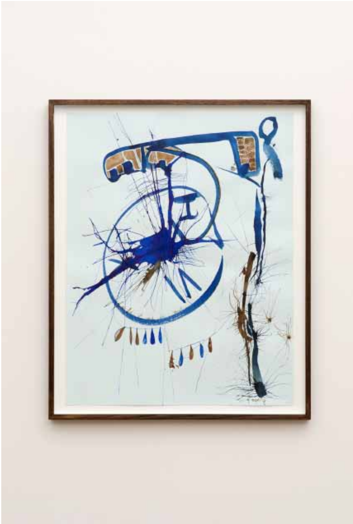
Untitled, 2014, fountain pen ink on paper, 19 1/2 x 25 1/2 inches (49,5 x 64,7 cm)