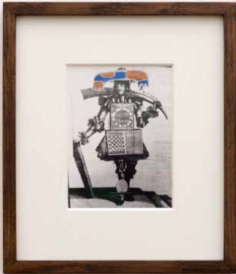
Habit de Tabletier, 2014, in collaboration with Liz Hopkins, color c-print, 4 x 6 inches (10,1 x 15,2 cm)