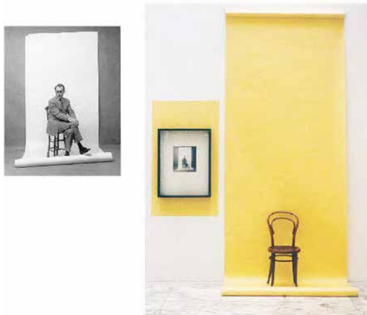
Barbara Bloom. Homage to J.-L. Godard, 1986, unfurled roll of yellow backdrop paper, bentwood café chair, wall paint, framed photograph by F.C. Gundlach, Jean-Luc Godard while representing his first movie À bout de souffle (1961)