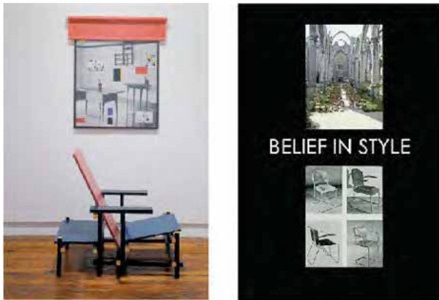
Barbara Bloom Belief in Style 1986, c-type print and Modernist Confession 1986, Gerrit Rietveld, Red Blue Chair, framed photograph mounted on board, cut and inset with photographs of Piet Mondrian's studio, red roller-blind.