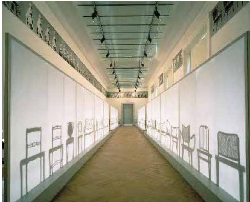
Bentwood chairs by Michael Thonet in the permanent collection of MAK, Vienna. Exhibition design by Barbara Bloom, including translucent walls, lights, photo frieze and screenprinted text labels, 1994