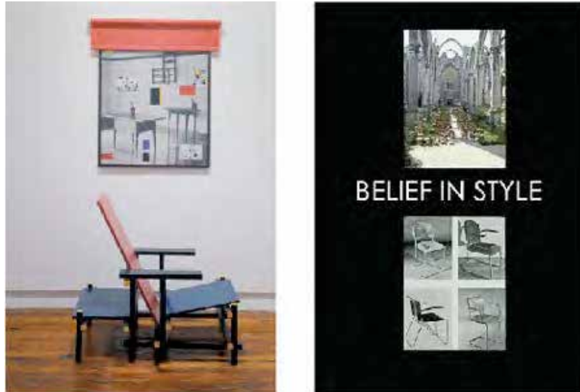
Barbara Bloom Belief in Style 1986, c-type print and Modernist Confession 1986, Gerrit Rietveld, Red Blue Chair, framed photograph mounted on board, cut and inset with photographs of Piet Mondrian's studio, red roller-blind.