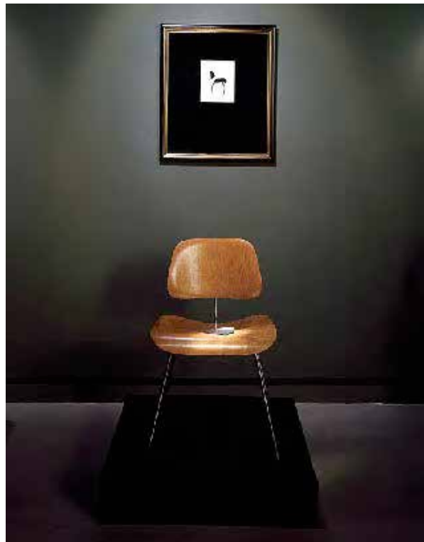
Barbara Bloom Pride from 'The Seven Deadly Sins', 1987, framed photograph in velvet mount, molded plywood Lounge Chair Metal by Charles and Ray Eames, calling card engraved with the word 'pride' on seat