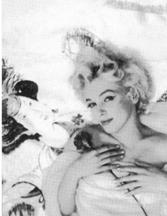
Barbara Bloom, Pictures From the Floating World: Scale Picture , 1995, Iris print 20 x 16", courtesy Jay Gorney Modern Art.

When I first saw Barbara Bloom's art-stage sets for life—I had to stop myself from moving in and making myself at home. Inviting in their clarity, hauntingly pristine, elegant in wit, tableaux from rooms and the adornments of life wait for their namesakes, wait for us. Her work collects remnants of lives lost or left behind ready to be taken up by an invisible presence. A presence activated by our gaze. The longing her work generates is profound: we are the vicarious vessels of our own desire, and the space she leaves for us in her art reflects this. Kiki Smith and Barbara met at Barbara's home in lower Manhattan. Kiki's reaction was not dissimilar to mine: it would be so easy to move in with Barbara, there is a fluidity to her home and her thoughts which is soothing, compelling, and easy to be around.